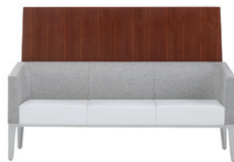
> SOFA #6103 > ARMS > PRIVATE BACK PANEL #FS-3AA-V > VENEER FINISH