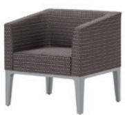
> LOUNGE #6101 > ARMS