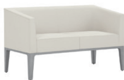
> LOVE SEAT #6102 > ARMS