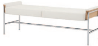
> 60" WIDE BENCH #5625 > CHROME FRAME