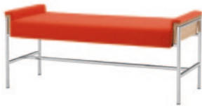
> 48" WIDE BENCH #5620 > CHROME FRAME

All standard and custom wood finishes available. Complementary lounge seating and occasional tables offered.