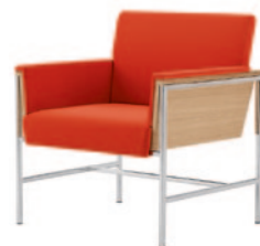
> LOUNGE #5601 > CHROME FRAME