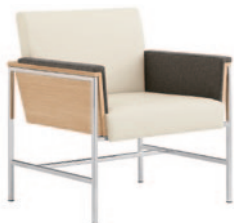
> LOUNGE #5601 > CHROME FRAME

Taking a sculptural approach to lounge seating, Aloft rises above the others to provide an awe-inspiring experience. An upholstered body, encased in elegant wood, is supported by a minimalist metal frame to create a virtual suspension effect that defies gravity and captures the imagination.