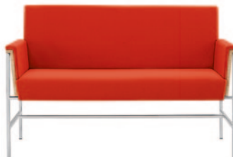
> LOVE SEAT #5602 > CHROME FRAME