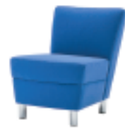
> LOUNGE #4641-G > CHROME FIXED LEGS