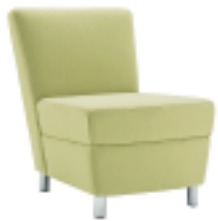
> LOUNGE #4541-G > ADULT-SIZE SERAFINA > CHROME FIXED LEGS