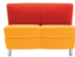
> LOVE SEAT #4642-G > METALLIC SILVER FIXED LEGS