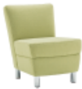
> LOUNGE #4641-G > CHROME FIXED LEGS