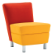
> LOUNGE #4641-G > METALLIC SILVER FIXED LEGS