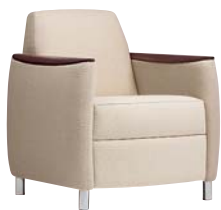
> LOUNGE #4331 > WOOD ARM CAPS > CHROME FIXED LEGS