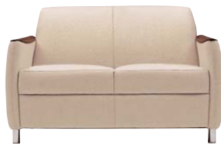
> LOVE SEAT #4332 > WOOD ARM CAPS > CHROME FIXED LEGS