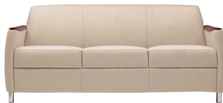
> SOFA #4333 > WOOD ARM CAPS > CHROME FIXED LEGS