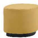
> BUDS BENCH #3780 > PLINTH BASE