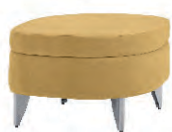
> BENCH #3771 > GRAPHITE LEGS

All models, excluding Buds benches, feature four wood or metal legs as standard. Metal legs available in Polished Aluminum as well as Metallic Silver, Metallic Champagne and Graphite powdercoat finishes. Lounge, bench and table models join together as is or for more permanent connections, a ganging leg option is also offered. Corresponding Leaf Modular collection available.