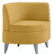
> LOUNGE #3770 > GRAPHITE LEGS